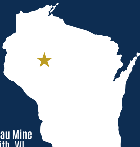
Flambeau Mine Ladysmith, WI

The Eagle Mine [14] in Michigan, a nickel and copper mine, began operations in 2014 and is still an operating mine. It has operated without harm or damage to the environment. Unfortunately, due to the intentional language used within the "Prove it First" bill requiring ten years of closure, this mine is not taken into consideration when evaluating a modern mine permitted and operated under modern environmental regulations.