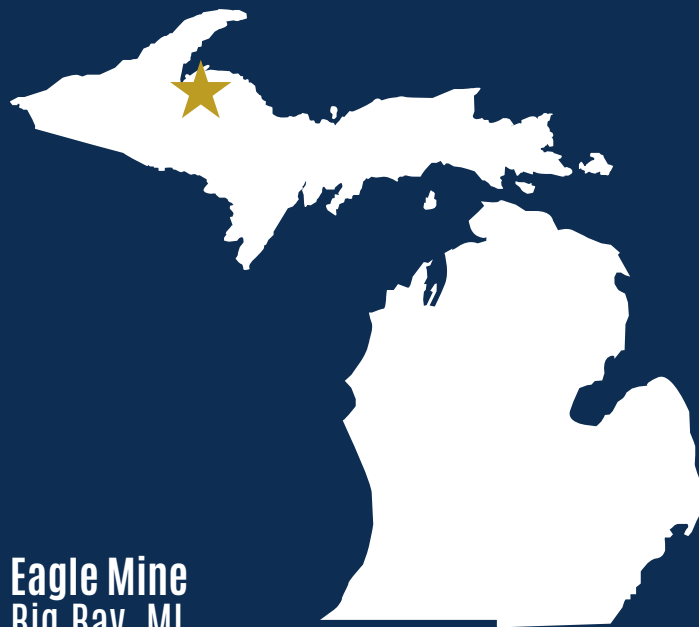
Eagle Mine Big Bay, MI